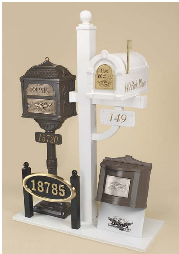
Actual product colors and finishes may vary from photo.

Congratulations. You have successfully completed the assembly of your Gaines Premier Display. You will enjoy many years of service from this product.